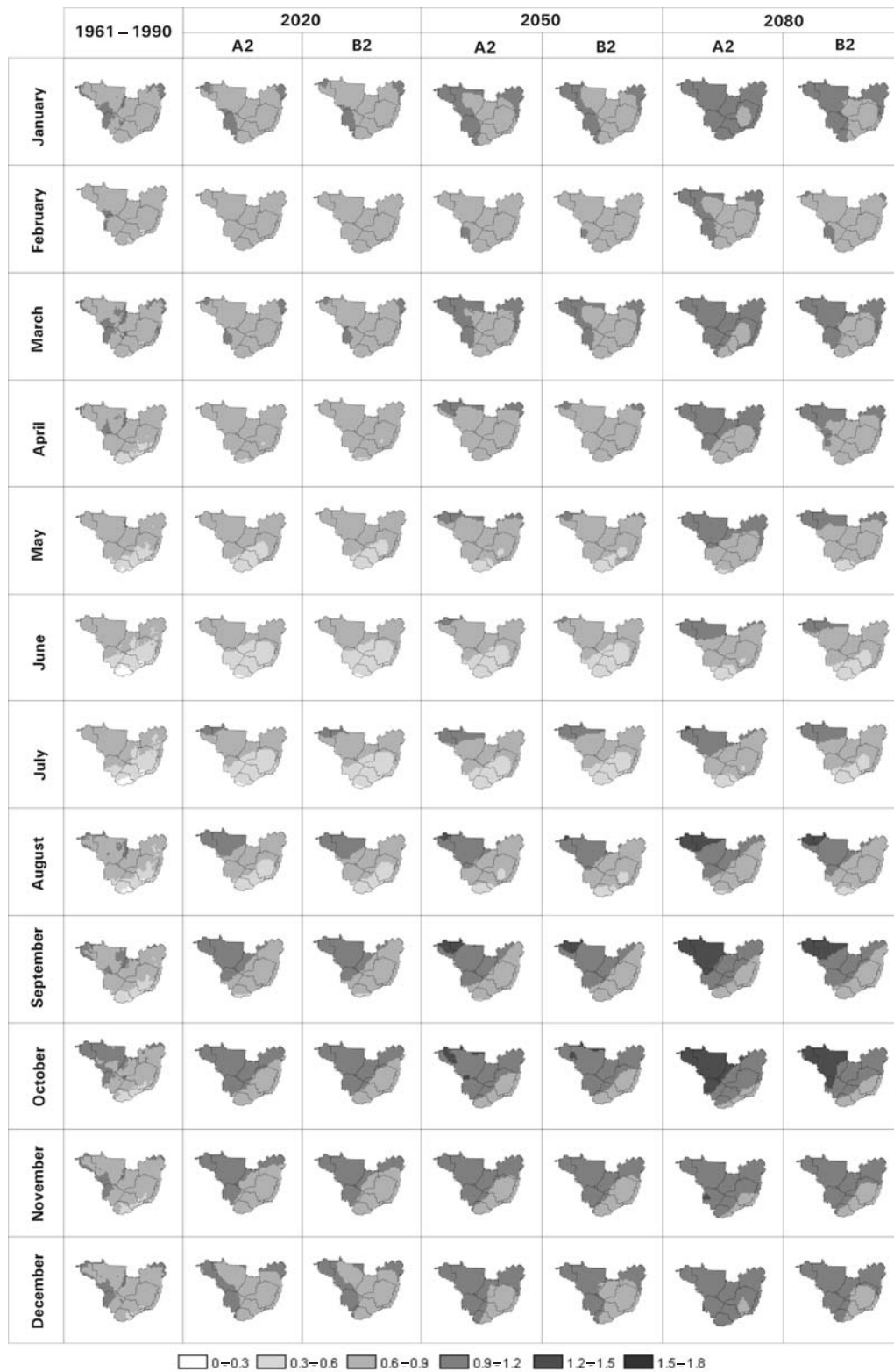
Figure 2. Maps of probable number of generations of Meloidogyne incognita race 4 on coffee plants, from January to December, for the climatological normal from 1961–1990 and future climates (2020, 2050, and 2080) in scenarios A2 and B2.