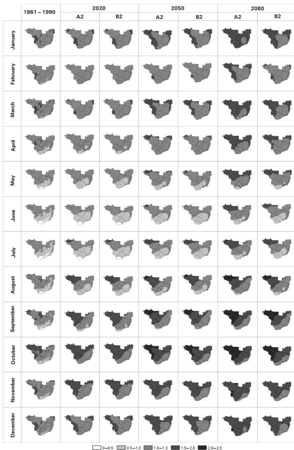
Figure 3. Maps of probable number of generations of coffee leaf miner ( Leucoptera coffeella ) on coffee plants, from January to December, for the climatological normal from 1961–1990 and future climates (2020, 2050, and 2080) in scenarios A2 and B2.