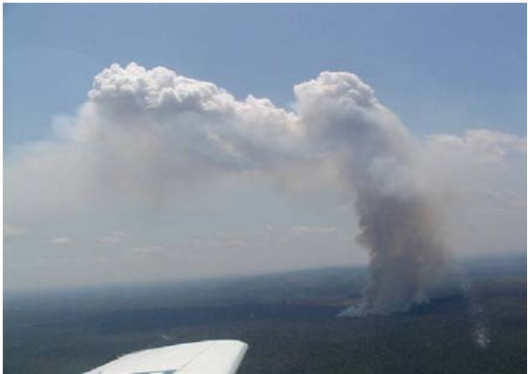
Figure 1. Photograph of the smoke plume rise produced from a deforestation fire in Amazon basin.

impact on the pollutant dispersion since in the troposphere the pollutants are advected faster away from the source region. Also removal processes are more efficient in the PBL; when the pollutants are transported to the troposphere their residence time increases. In order to illustrate this mechanism, Figure 1 shows the plume rise associated to a deforestation fire on State of Rondônia, Brazil, during the SMOCC campaign.