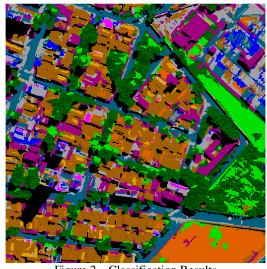
Figure 2 – Classification Results

Figure 2 shows the interpretation results in terms of a thematic map depicting the final classification performed with InterImage.