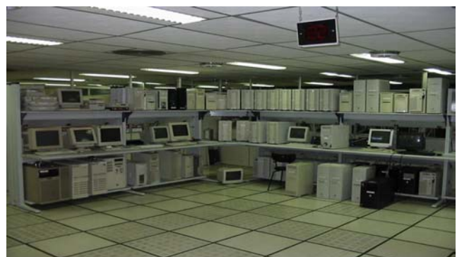
Figure 1. UFRJ 24x7 Network Operations Center

Since one of Brazil's Internet2 connection points is housed in Rio de Janeiro, and since the UFRJ was already ingesting data as an IDD receive-only node, we approached the UFRJ with a proposal that they act as a top-level IDD relay node, initially for the RMTCs at the UFPA and the UBA in Buenos Aires and then throughout Brazil (Yoksas, Garrana, 2002). The UFRJ expressed an eagerness to act in this role on behalf of their fellow institutions by relaying data through improved departmental networking and computing infrastructure. Equipment that they purchased was installed in the UFRJ 24x7 Network Operation Center (NOC).