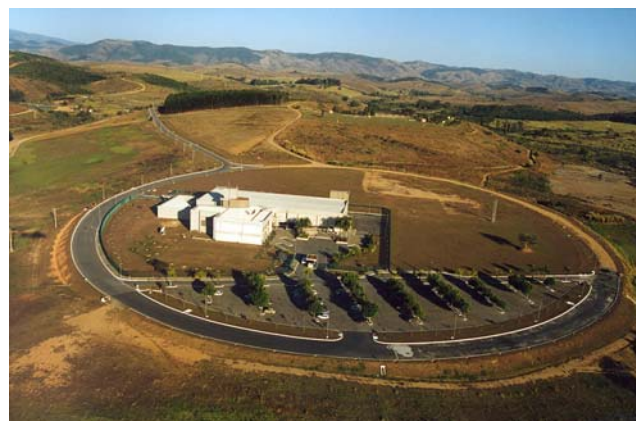
Figure 4. CPTEC facility located at Cachoeira Paulista, Rio de Janeiro, Brazil.

In the fall of 2003, an additional connection was made that has strengthened the data relay capabilities in Brazil. Co-author Waldenio Gambi de Almeida, a member of the data section of the CPTEC ( http://www.cptec.inpe.br/ ), attended the fall series of Unidata training workshops in Boulder, Colorado.