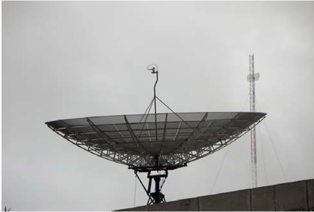
Figure 5. 7 meter satellite dish portion of Unidata NOAAPORT reception system installed at the UCR.

In February 2004, the UPC worked with the Universidad de Costa Rica to install a UPC-designed and built NOAAPORT satellite ingestion system on the UCR campus in San Jose, Costa Rica. Since the installation, the UCR has been able to ingest real-time global observations and NCEP model output for use in education and research. The UCR has agreed in principle that, as its Internet connectivity improves, it will assume a leading role in extending access to its real-time meteorology data to Central American universities that also have sufficient Internet connections.