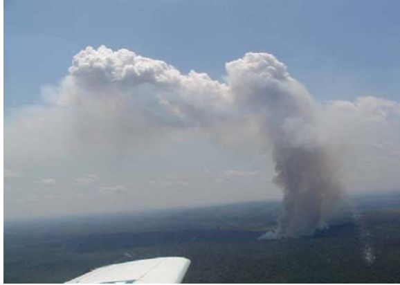
Figure 1. Photograph of the smoke plume rise produced from a deforestation fire in Amazon basin.

impact on the pollutant dispersion since in the troposphere the pollutants are advected faster away from the source region. Also removal processes are more efficient in the PBL; when the pollutants are transported to the troposphere their residence time increases. In order to illustrate this mechanism, Figure 1 shows the plume rise associated to a deforestation fire on State of Rondônia, Brazil, during the SMOCC campaign.