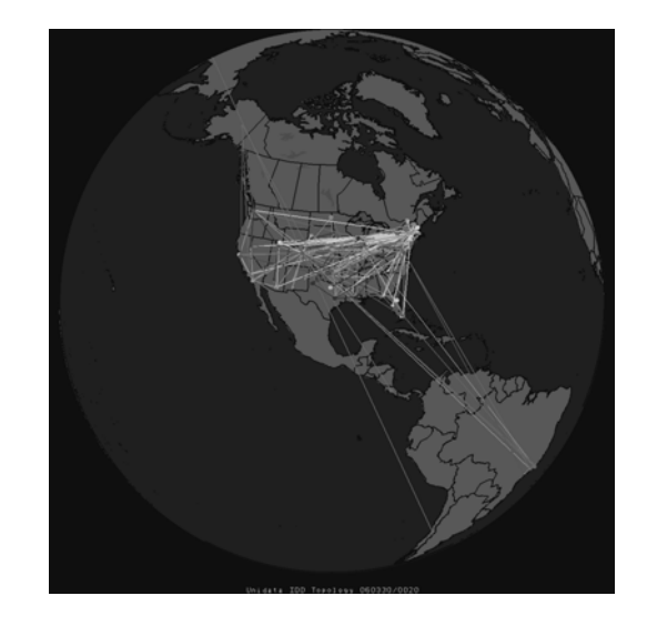
Figure 1 – Unidata IDD Topology.

Furthermore, any user of this software can also publish new products and distribute it to anyone on this network.